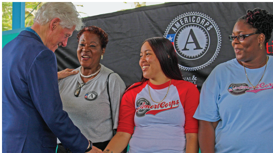
President Bill Clinton greets Project Reach LSSVI AmeriCorps members at Queen Louise Home for Children.

Summer is here and flamboyant trees have splattered their red and orange colors across the hills in the Virgin Islands. It is impossible to ignore their stunning beauty. Here at LSSVI, each of the individuals in our care is like a radiant flamboyant tree. They bloom each day and show their beauty in the resilient ways they cope with and overcome their challenges. We embrace every chance we get to love and care for them. The love we share with them comes from the hope we receive from you. You are our guardian angels and we thank you for inspiring and supporting our work in the community. The gifts you share are blessings to the children, seniors, families and adults with disabilities in our care. Thank you for your kindness and for your continuing to trust and believe in our mission.